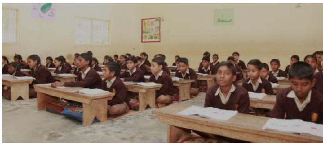
Children in Project Mala School

A Charity, registered under Societies Registration Act 1860 (Reg No. S- 20439 of 1989) Foreign Contribution Regulation Act (FCRA) 1976, Income Tax Act -1961 u/s 80 G.